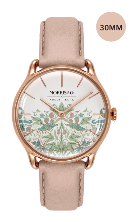
STRAWBERRY THIEF - $379.95

M1ST0530A28LWB INDIGO MOTIF DIAL 30MM ROSE GOLD CASE WOAD BLUE LEATHER STRAP