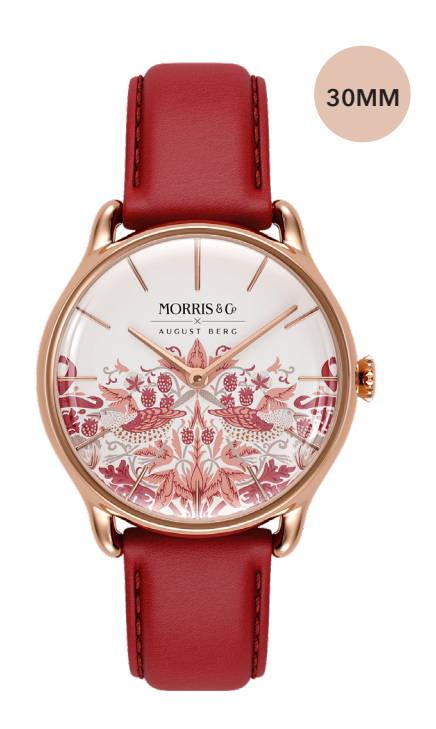
STRAWBERRY THIEF BIRD - $379.95

M1ST0530A29LDP INDIGO MOTIF DIAL 30MM ROSE GOLD CASE COCHINEAL DUSTY PINK LEATHER STRAP