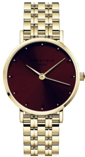
SEGS-SE01 Small Edit Burgundy Sunray Gold AUD 189.95