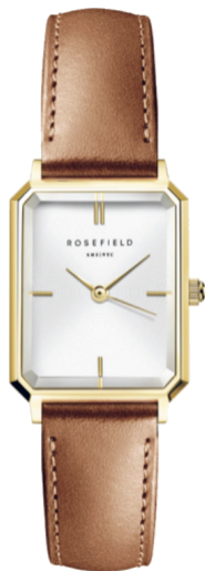
OWBLG-O85 Octagon XS White Gold Light Brown Leather AUD 169.95