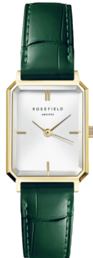
OWGLG-O86 Octagon XS White Gold Emerald Croco Leather AUD 169.95