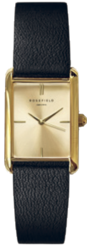
HCBLG-H07 Heirloom Champagne Gold Black Leather AUD 169.95