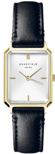
OWBLG-O84 Octagon XS White Gold Black Leather AUD 169.95