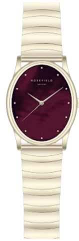
OVGSG-OV15 Oval Burgundy Sunray Gold Matte & Shine Finish AUD 189.95