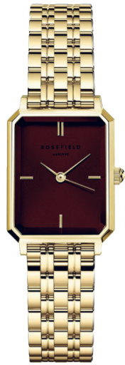
OBGSG-O83 Octagon XS Burgundy Sunray Gold AUD 199.95