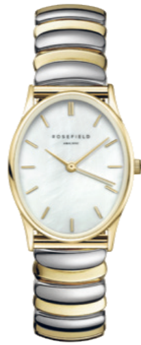
OVWDSG-OV17 Oval White MOP Duotone Shine Finish AUD 189.95