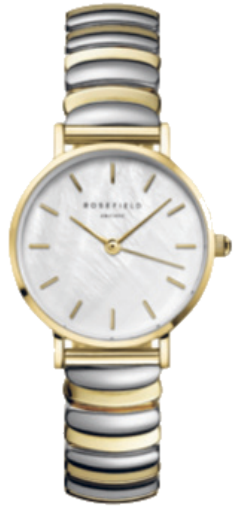
SEWDSG-SE03 Small Edit White MOP Duotone Shine Finish AUD 189.95