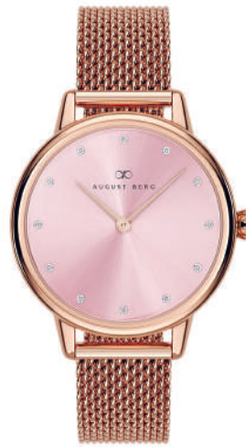
10928A23MRG Serenity PETITE Rose Gold Blossom Pink Mesh 28mm $329.95