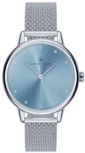
10928E21MSL Serenity PETITE Silver Dusty Blue Mesh 28mm $299.95