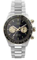
Waterbury Heritage Chronograph 39mm Stainless Steel Bracelet Watch

WATERBURY METROPOLITAN SUB-SECOND SST SILVER DIAL BLACK STRAP