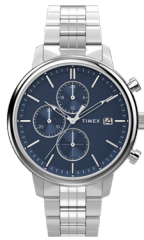
Chicago Chrono 45mm Silver Tone Blue Dial Brown Leather Strap

Chicago Chrono 45mm Silver Tone Blue Dial Bracelet