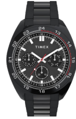
Weston 45mm Stainless Steel Bracelet Watch

Mens Silver-tone Case and Brace- let with Black Dial