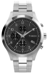
Weston Dress Chronograph 43mm Stainless Steel Bracelet Watch