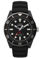
Deepwater Reef 200 XCF 43mm Synthetic Rubber Strap Watch

Deepwater Meridian 200 Stainless Steel Case and Bracelet Blue dial