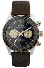
Waterbury Heritage Chronograph 39mm Leather Strap Watch

WATERBURY HERITAGE CHRONOGRAPH SST BLACK DIAL BRACELET STRAP