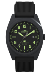
Expedition® Capstone 39mm Silicone Strap Watch

Expedition Gunmetal Case Black Dial Green Silicone Strap