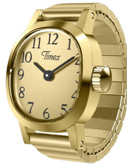
Cavatina® Mini 16mm Stainless Steel Expansion Band Ring Watch TW2Y70800 AUD 199.95 UPC: 2026-02-16 Cavatina Ring Watch All Gold-Tone with Champagne Dial