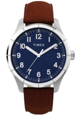
Main Street 42mm Leather Strap Watch

Mens Main Street Silver-tone Case and Brown Strap with Blue Dial