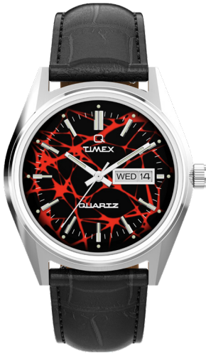
Q Timex Red Vega Reissue 38mm Leather Strap Watch TW2Y55700 AUD 379.95 UPC: 2026-01-19 Q Timex Red Vega Reissue 38mm Men's Strap Watch