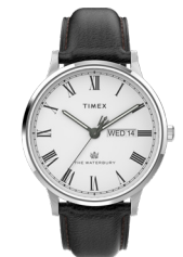
Waterbury Classic Day/Date 40mm Leather Strap Watch

Waterbury Classic Men's 40mm Chrono SST Case Blk Dial Blk Strap