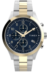
Weston Dress Chronograph 43mm Stainless Steel Bracelet Watch

Weston Chrono Stainless Steel Case and Bracelet Black Dial