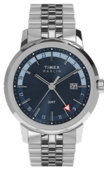
Marlin® Quartz GMT 40mm Stainless Steel Bracelet Watch

Marlin 34mm Gold Tone Case with Brown Strap and Green Dial