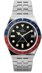
Q Timex GMT 38mm Stainless Steel Bracelet Watch

Mens Black Case and Bracelet with Black Dial