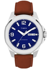
Essex Day & Date 46mm Leather Strap Watch

Essex Ave 46 ST Case Black Dial Bracelet