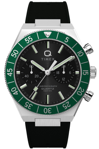
Q Timex Continental Chronograph 40mm Synthetic Rubber Strap Watch TW2Y56100 AUD 399.95 UPC: 2026-01-19 Q Timex Continental Chronograph