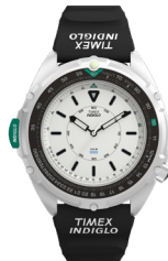
Timex 1995 Intrepid Reissue 46mm Synthetic Rubber Strap Watch

Deep Water Reef 200 Black Composite Blue Strap