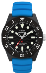
Deepwater Reef 200 XCF 43mm Synthetic Rubber Strap Watch

Deep Water Reef 200 Black Composite Black Strap