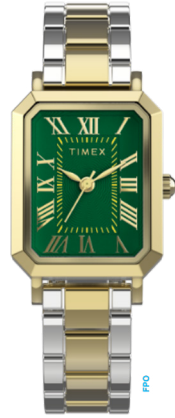
Vivienne Trend 21mm Bracelet Watch TW2Y72000 AUD 199.95 UPC: 2026-01-19 Womens Gold-tone Case and Two-tone Bracelet with Green Dial