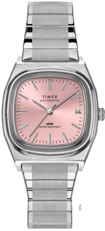
Timex® Automatic 1983 E Line 34mm Stainless Steel Expansion Band Watch TW2Y66800 AUD 449.95 UPC: 2026-01-19 E Line All Silver-tone with Pink Dial