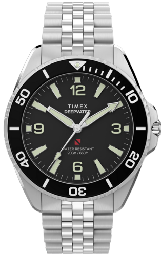
Deepwater Arctic 40.5mm Stainless Steel Bracelet Watch TW2Y64500 AUD 499.95 UPC: 2026-01-19 Deep Water Arctic Quartz 200 Blk Dial SST Bracelet