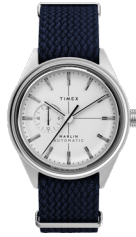
Marlin® Jet Automatic 38mm Fabric Strap Watch

Waterbury Heritage Chrono Stainless Steel Case Black Dial Brown Leather Strap