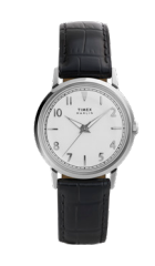
Marlin® Quartz 34mm Leather Strap Watch

Marlin Quartz Moon Phase 40mm SST Case Green Dial Bracelet