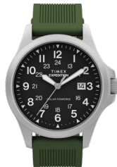
Expedition® Field Post Solar 41mm Silicone Strap Watch

Expedition Black Case Black Dial Black Silicone Strap