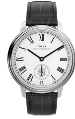
Waterbury Metropolitan Sub-Second 39mm Leather Strap Watch

WATERBURY ACE CHRONOGRAPH SST CASE GREEN DIAL BRACELET STRAP