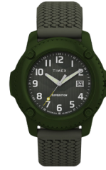
Expedition® Timber 42mm Silicone Strap Watch

Expedition Timber Aluminum Case Brown Dial and Silicone Strap