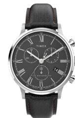
Waterbury Classic Chronograph 40mm Leather Strap Watch

E Line Auto Gold Tone Stainless Steel Case and Expansion Cham- pagne Dial