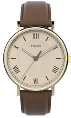
Mens Southview with Gold-tone Case and Brown Leather Strap

Mens's 41mm Southview Tan Leather Strap/Blue Dial