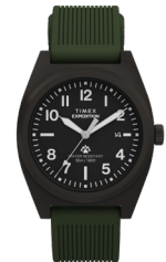
Expedition® Capstone 39mm Silicone Strap Watch

Diver Style SST Case White Dial Black Strap