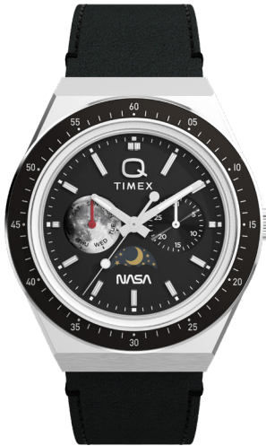
Q Timex Vintage Inspired NASA 40mm Leather Strap Watch TW2Y56800 AUD 429.95 UPC: 2026-02-16 Q Timex NASA Collab