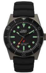
Deepwater Reef 200 41mm Synthetic Rubber Strap Watch

Deepwater Reef 200 Stainless Steel Case Blue Dial Black Rubber Strap