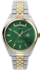
Timex Legacy 41mm Stainless Steel Bracelet Watch

MARLIN QUARTZ GMT 40MM SST CASE BLUE DIAL AND STRAP