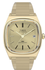
Timex® Automatic 1983 E Line Re- issue 34mm Gold-Tone Expansion Band Watch

E Line Auto Stainless Steel Case and Expansion Band White Dial