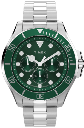
Harborside Coast Multifunction 43mm Stainless Steel Bracelet Watch