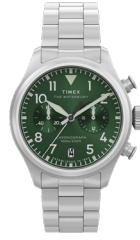
Waterbury Ace Chronograph 41mm Stainless Steel Bracelet Watch

WATERBURY ACE CHRONOGRAPH SST CASE SILVER DIAL BROWN STRAP