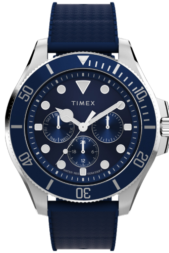
Harborside Coast Multifunction 43mm Synthetic Rubber Strap Watch

Harborside Coast Multifunction Black Dial Bracelet