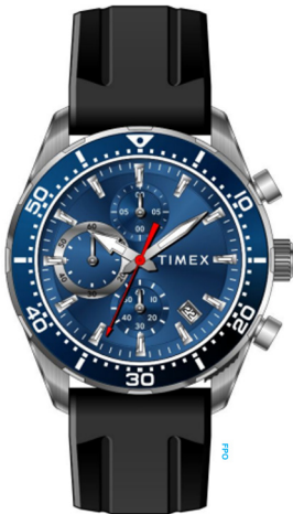
Ridgefield Chronograph 42mm Silicone Strap Watch