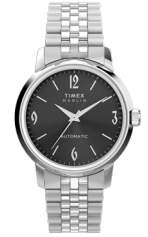
Marlin® Automatic 40mm Stainless Steel Bracelet Watch

Marlin Automatic 40mm SST Case Blue Dial Black Leather Strap