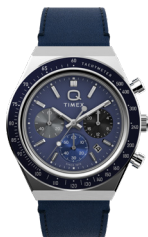
Q Timex® Chronograph 40mm Leather Strap Watch