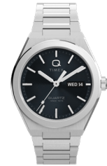
Q Timex® Continental Day and Date 39mm Stainless Steel Brace- let Watch

Q TIMEX CONTINENTAL GMT SST CASE SILVER DIAL BLACK SYN RUBBER STRAP