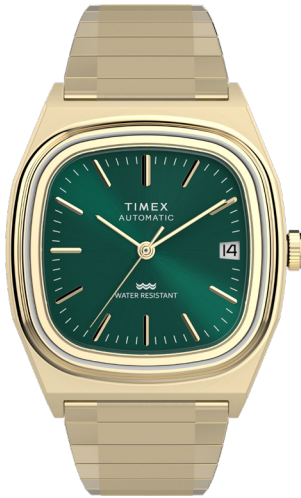
Timex® Automatic 1983 E Line 34mm Stainless Steel Expansion Band Watch TW2Y67700 AUD 449.95 UPC: 2025-10-20 E Line All Gold-tone with Green Dial