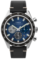
Waterbury Traditional Chronograph 41mm Leather Strap Watch