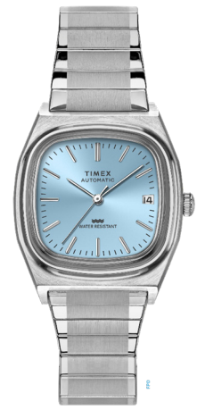
Timex® Automatic 1983 E Line 34mm Stainless Steel Expansion Band Watch

Marlin Quartz Chrono 40mm Ice Blue Dial Brown Strap