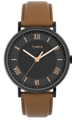
Mens Southview with Black Case and Tan Leather Strap