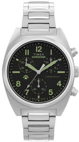
Expedition® Capstone Chronograph 41mm Stainless Steel Bracelet Watch TW2Y61200 AUD 349.95 UPC: 2026-02-16 Expedition Capstone Chronograph Black Dial SST Bracelet