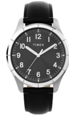
Main Street 42mm Leather Strap Watch

Mens Main Street Silver-tone Case and Black Strap with Black Dial