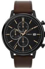
Chicago Chrono 45mm Two Tone Case Blue Dial Bracelet

Chicago Chrono 45mm Black Case Black Dial Brown Leather Strap