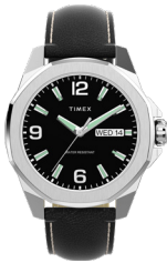
Essex Day & Date 46mm Leather Strap Watch

Essex Ave 46 ST Case Blue Dial Brn Leather Strap