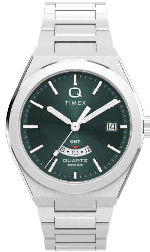
Q Timex Continental GMT 39mm Stainless Steel Bracelet Watch TW2Y24800 AUD 379.95 UPC: 2026-01-19 Q GMT SST Green Dial Bracelet