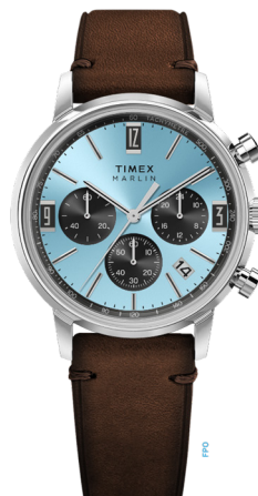
Marlin® Quartz Chronograph 40mm Leath- er Strap Watch

Marlin Quartz Chrono 40mm Ice Blue Dial SST Bracelet