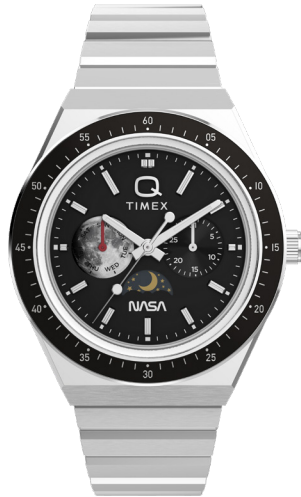
Q Timex Vintage Inspired NASA 40mm Stainless Steel Bracelet Watch TW2Y56700 AUD 479.95 UPC: 2026-02-16 Q Timex NASA Collab