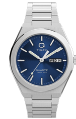
Q Timex® Continental Day and Date 39mm Stainless Steel Brace- let Watch