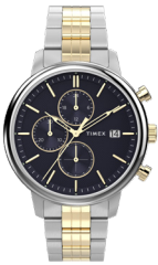
Chicago Chrono 45mm Silver Tone Blue Dial Bracelet