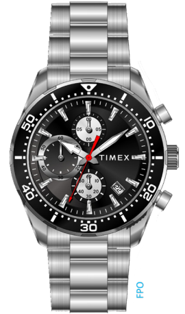
Ridgefield Chronograph 42mm Stainless Steel Bracelet Watch

Harborside Coast Multifunction Blue Dial Blue Resin Strap