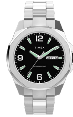
Essex Day & Date 46mm Stainless Steel Bracelet Watch

Essex Ave 46 ST Case Green Dial Bracelet