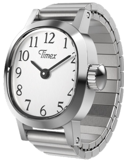
Cavatina® Mini 16mm Stainless Steel Expansion Band Ring Watch TW2Y70700 AUD 199.95 UPC: 2026-02-16 Cavatina Ring Watch All Silver-Tone with White Dial