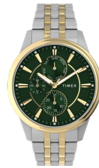
Chicago Multi 45mm Silver Tone Case Black Dial Black Strap

Chicago Multi 45mm Two Tone Case Green Dial Bracelet