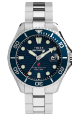
Deepwater Meridian 200 44mm Stainless Steel Bracelet Watch

Deepwater Reef 200 Black Stainless Steel Case Black Dial Black Rubber Strap