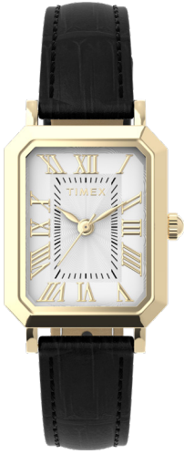
Vivienne Trend 21mm Leather Strap Watch TW2Y71900 AUD 179.95 UPC: 2026-01-19 Womens Gold-tone Case and Black Strap with White Dial