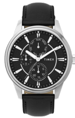
Chicago Multi 45mm Silver Tone Case Black Dial Black Strap