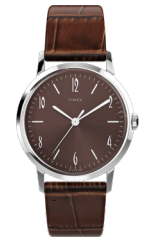
Marlin® Hand-Wound 34mm Leather Strap Watch

Marlin Automatic 40mm SST Case Black Dial Bracelet