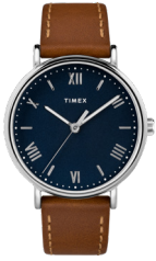
Southview 41mm Leather Strap Watch