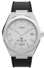
Q Timex® Continental GMT 39mm Synthetic Rubber Strap Watch

Q TIMEX CONTINENTAL GMT SST CASE BLACK DIAL BRACELET