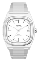
Timex® Automatic 1983 E Line Reissue 34mm Stainless Steel Expansion Band Watch