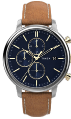
Chicago Chrono 45mm Silver-tone Case Blue Dial Brown Leather Strap

Chicago Chronograph 45mm Leather Strap Watch