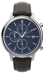
Chicago Chrono 45mm Silver Tone Blue Dial Brown Leather Strap