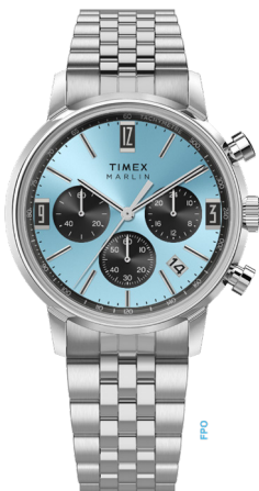
Marlin® Quartz Chronograph 40mm Stain- less Steel Bracelet Watch