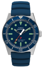
Deepwater Reef 200 41mm Synthetic Rubber Strap Watch

Essex Ave 46 ST Case Black Dial Brn Leather Strap