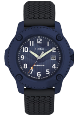
Expedition® Timber 42mm Silicone Strap Watch

Expedition Ridge Silver-tone Case Green Dial Silicone Strap