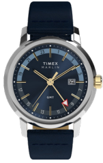
Marlin® Quartz GMT 40mm Leather Strap Watch