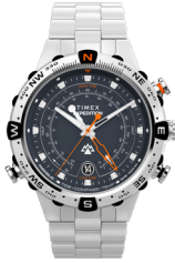
Expedition Tide-Temp-Compass 45mm Stainless Steel Bracelet Watch

Expedition Tide/Temp/Compass Black IP Stainless Steel Case Natural Dial Brown Leather Strap