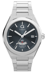
Q Timex® Continental GMT 39mm Stainless Steel Bracelet Watch

Q Timex GMT Stainless Steel Case and Bracelet Black Dial