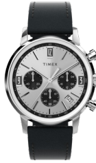
Marlin® Chronograph Tachymeter 40mm Leather Strap Watch

Marlin Jet Auto Stainless Steel Case Silver-White Dial Navy Fabric Strap