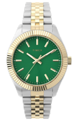
Timex Legacy 36mm Stainless Steel Bracelet Watch

TEENY TINY TIMEX GOLD TONE CASE AND PERFECT FIT EXPANSION BAND