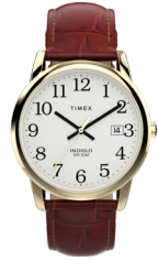
Easy Reader® 35mm Leather Strap Watch

Easy Reader Gold-tone Case with White Dial and Brown Strap