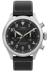
Waterbury Ace Chronograph 41mm Leather Strap Watch

Waterbury Chrono Stainless Steel Case Blue Dial Black Leather Strap