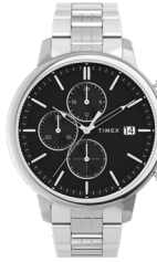
Chicago Chrono 45mm Black Case Black Dial Brown Leather Strap

Chicago Chrono 45mm Silver-tone Case Black Dial SST Bracelet