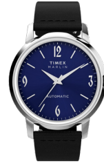
Marlin® Automatic 40mm Leather Strap Watch

Marlin Chrono Stainless Steel Case Silver Dial Black Leather Strap