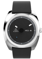
Q Timex® 1975 Enigma 37mm Leather Strap Watch