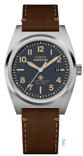
Expedition® Capstone 39mm Eco-Friendly Leather Strap Watch TW2Y30600 AUD 229.95 UPC: 2026-01-19 Expedition Field 39mm Gunmetal Case Blue Dial Brown Leather