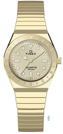
Q Timex® Mini 30mm Stainless Steel Expansion Band Watch TW2Y57500 AUD 379.95 UPC: 2026-01-19 Womens Mini Q All Gold-tone with Cream Dial and Gold Top Ring