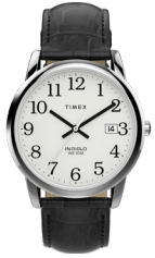
Easy Reader® 35mm Leather Strap Watch