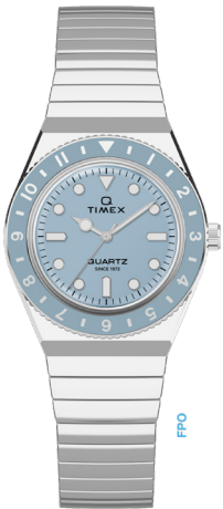
Q Timex® Mini 30mm Stainless Steel Expansion Band Watch TW2Y77300 AUD 379.95 UPC: 2026-01-19 Womens Mini Q All Silver-tone with Ice Blue Dial and Top Ring