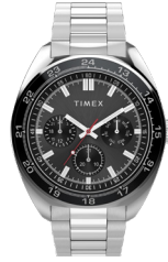
Weston 45mm Stainless Steel Bracelet Watch

Weston Chrono Two Tone Stainless Steel Case and Bracelet Blue Dial