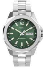
Essex 44mm Stainless Steel Bracelet Watch

Men's Legacy 41mm Two Tone Case Green Dial Bracelet