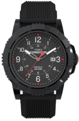
Expedition Ridge 43mm Silicone Strap Watch