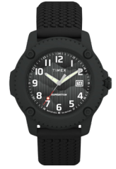
Expedition® Timber 42mm Silicone Strap Watch

Expedition Timber Aluminum Case Green Dial and Silicone Strap