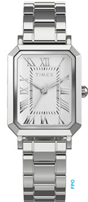
Vivienne Trend 21mm Bracelet Watch TW2Y57900 AUD 199.95 UPC: 2026-01-19 Womens Silver-tone Case and Bracelet with White Dial