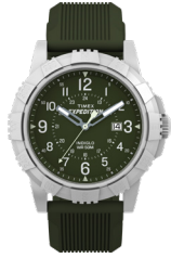
Expedition Ridge 43mm Silicone Strap Watch

Expedition Ridge Black Case and Dial Black Silicone Strap