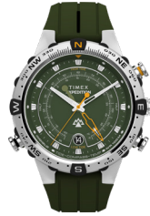
Expedition® Tide-Temp-Compass 45mm Silicone Strap Watch

Expedition Tide-Temp-Compass SST Case Blue Dial SST Bracelet