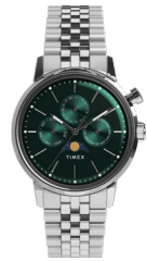
Marlin® Moon Phase Multifunction 40mm Stainless Steel Bracelet Watch

Marlin Handwind 34mm SST Case Brown Dial Brown Leather Strap