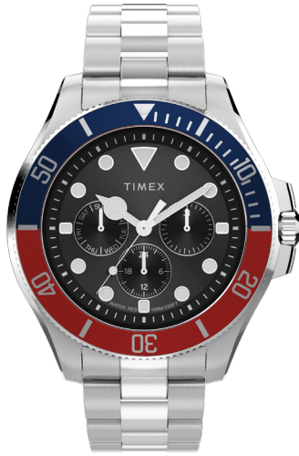
Harborside Coast Multifunction 43mm Stainless Steel Bracelet Watch

Harborside Coast Multifunction Green Dial Bracelet