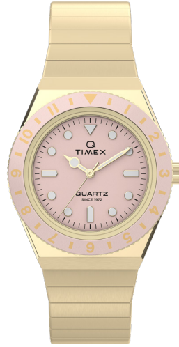
Q Timex® Mini 30mm Stainless Steel Expansion Band Watch TW2Y57400 AUD 379.95 UPC: 2026-01-19 Womens Mini Q All Gold-tone with Pink Dial and Top Ring