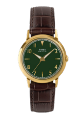
Marlin® Quartz 34mm Leather Strap Watch

Marlin 34mm SST Case with Black Strap and Silver Dial