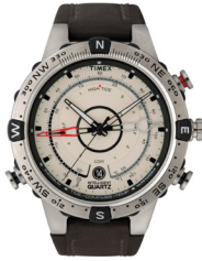
Intelligent Quartz® Tide Temp Compass 45mm Leather Strap Watch

Expedition Timber Aluminum Case Black Dial and Silicone Strap