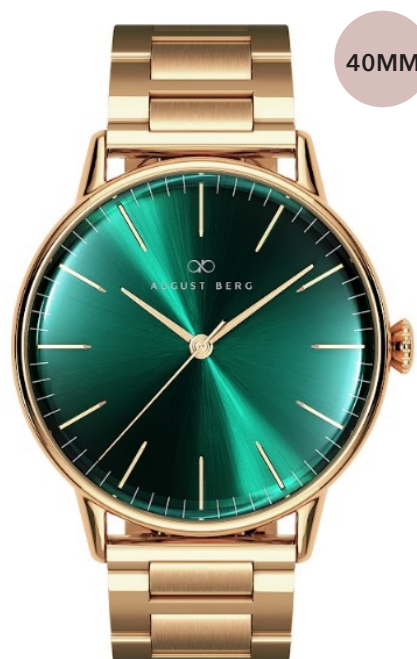
GREENHILL - $429.95

CHAMPAGNE SUNRAY DIAL 40MM GOLD CASE GOLD BRACELET STRAP