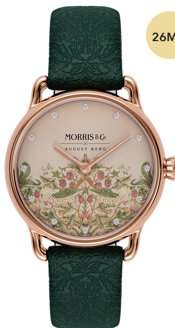
STRAWBERRY THIEF - $379.95

FENNEL MOTIF DIAL 30MM SILVER CASE FENNEL PERLON STRAP