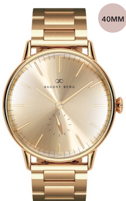
CLASSIC CHAMPAGNE - $429.95

GREEN SUNRAY DIAL 40MM SILVER CASE SILVER BRACELET STRAP