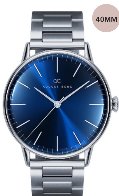
DEEP BLUE - $379.95