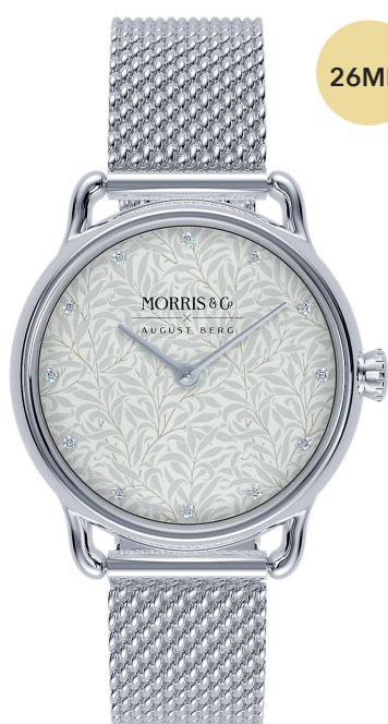
SILVER WILLOWBOUGH - $349.95