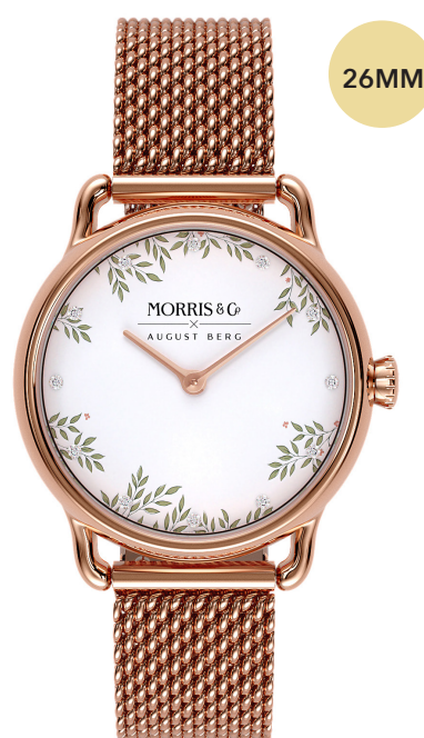
LOVE IS ENOUGH - $399.95

PURE MOTIF DIAL 26MM SILVER CASE SILVER MESH STRAP