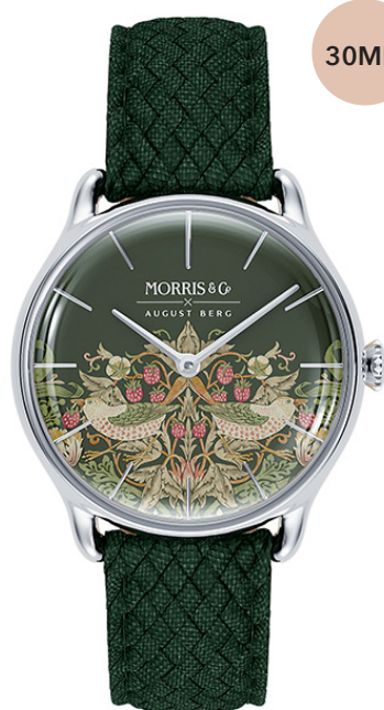
STRAWBERRY THIEF - $379.95

WHITE MOTIF DIAL 26MM ROSE GOLD CASE ROSE GOLD MESH STRAP