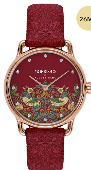
STRAWBERRY THIEF - $379.95

PRIMROSE MOTIF DIAL 26MM ROSE GOLD CASE DARK FENNEL EMBOSSED LEATHER STRAP