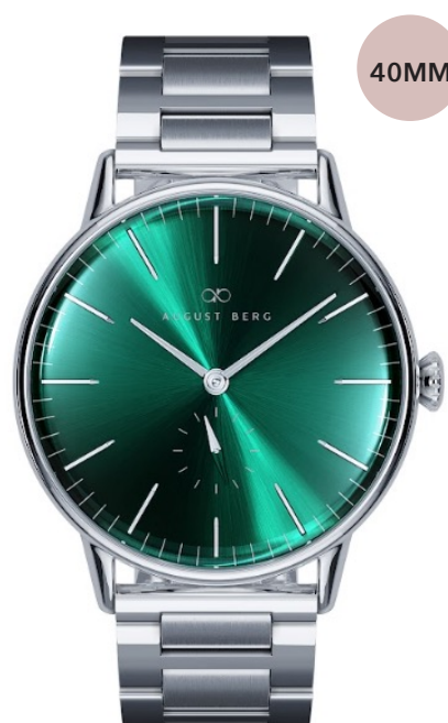
GREENHILL - $379.95

BLUE SUNRAY DIAL 40MM SILVER CASE SILVER BRACELET STRAP