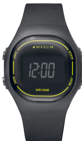
NOMAD - $99 X2212L1