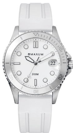
LIBERTY - $199.00 MW23200L06