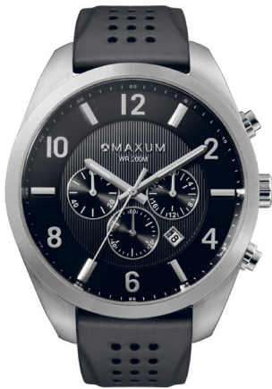
LANSDOWNE - $229.00 MW23102G04