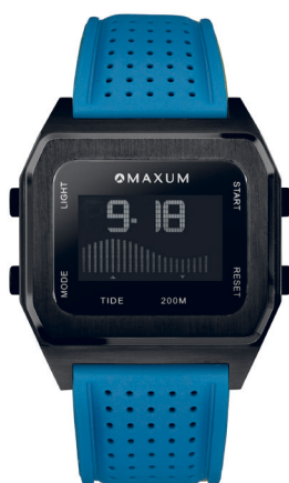
RAGLAN - $299.00 MW23104G05