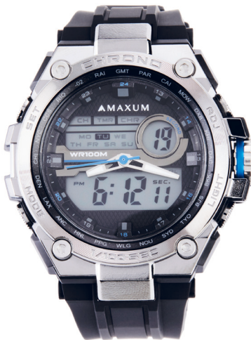
MINI BULK - $119 X2122G1