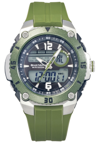
MAVERICK - $119 X2001G2