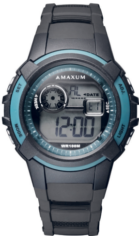
BUTTON - $99 X2276L1