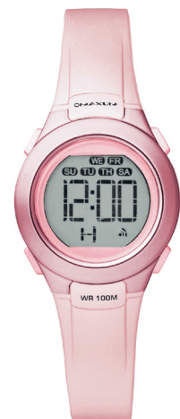
MINIMAX MARK 2 - $99 X2007L1