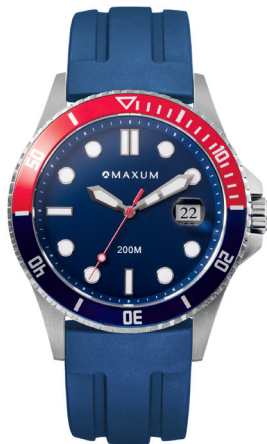
PRINCE - $199.00 MW23100G05