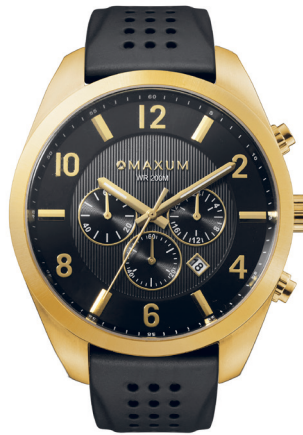
LANSDOWNE - $249.00 MW23102G05