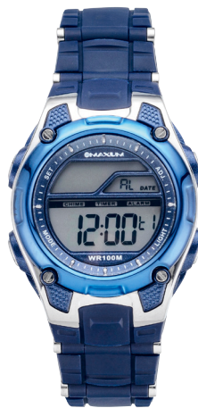
SWING - $99 X9101L2