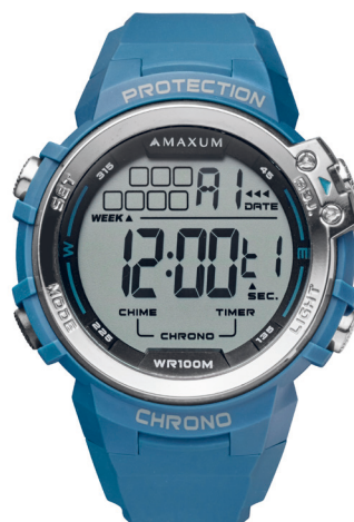
EXPLORER - $99 X2223G2