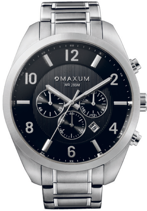
LANSDOWNE - $279.00 MW23102G01