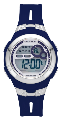
AVOCA - $99 X2111L2