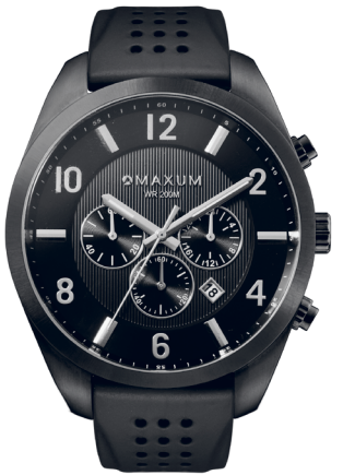
LANSDOWNE - $249.00 MW23102G06