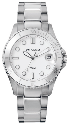
LIBERTY - $249.00 MW23200L02