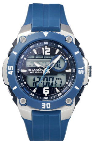
MAVERICK - $119 X2001G1