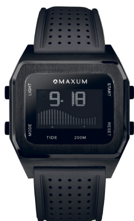
RAGLAN - $299.00 MW23104G04