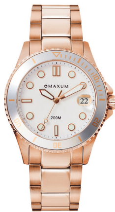
LIBERTY - $299.00 MW23200L04