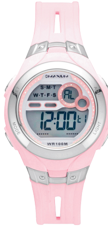
AVOCA - $99 X2111L1