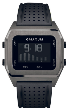
RAGLAN - $299.00 MW23104G07