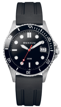
LIBERTY - $199.00 MW23200L05