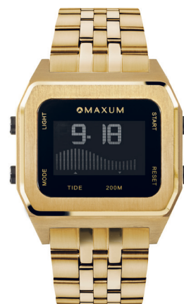
RAGLAN - $349.00 MW23104G03