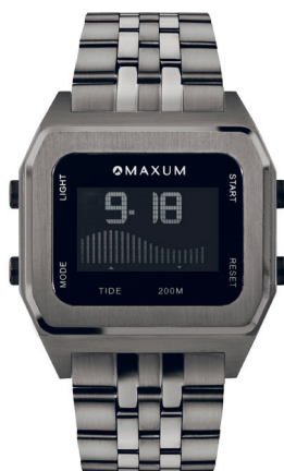
RAGLAN - $349.00 MW23104G02