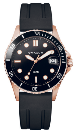
LIBERTY - $249.00 MW23200L07