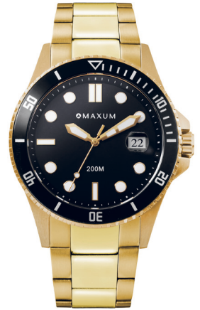
PRINCE - $299.00 MW23100G03