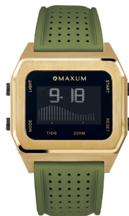
RAGLAN - $299.00 MW23104G12