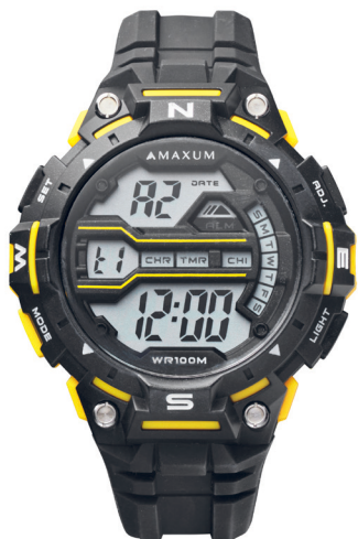
PIONEER - $99 X2221G1