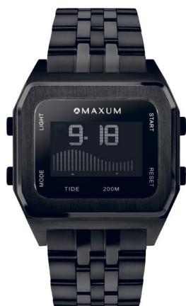
RAGLAN - $349.00 MW23104G01