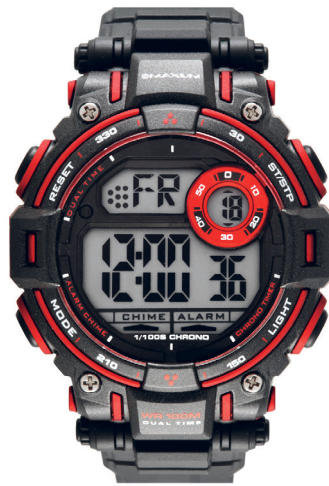
SURFARI - $99 X1706L1