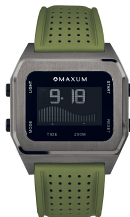
RAGLAN - $299.00 MW23104G09