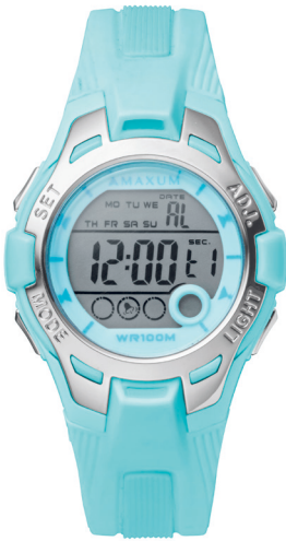
CANDY - $99 X2213L2