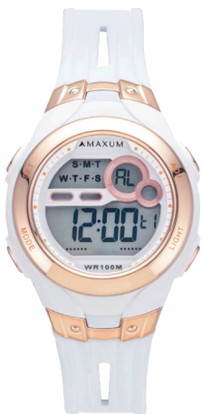
AVOCA - $99 X1411L2