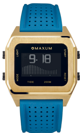
RAGLAN - $299.00 MW23104G11