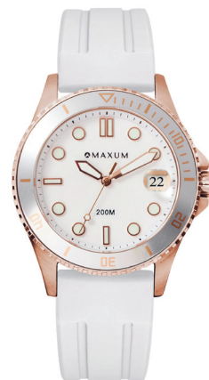
LIBERTY - $249.00 MW23200L08