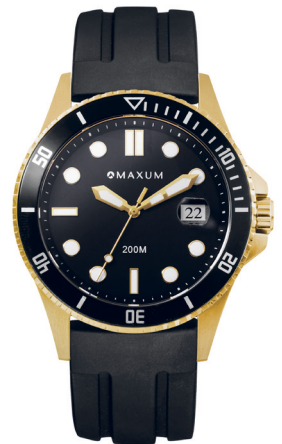
PRINCE - $249.00 MW23100G06