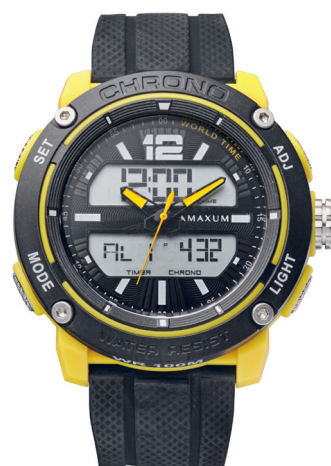
CONQUEST - $119 X2213G1