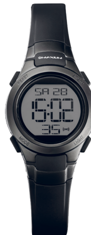
MINIMAX - $99 X1807L1