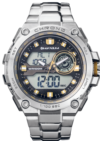
BULK - $149 X1720G2