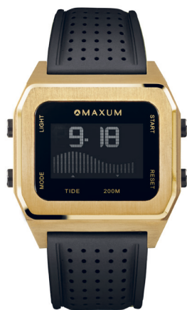
RAGLAN - $299.00 MW23104G10