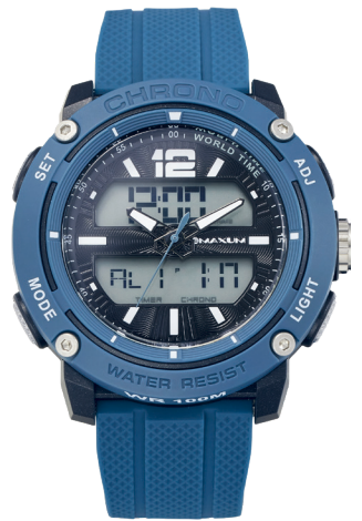
CONQUEST - $119 X2013G2