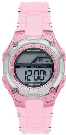
SWING - $99 X2114L1