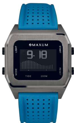
RAGLAN - $299.00 MW23104G08