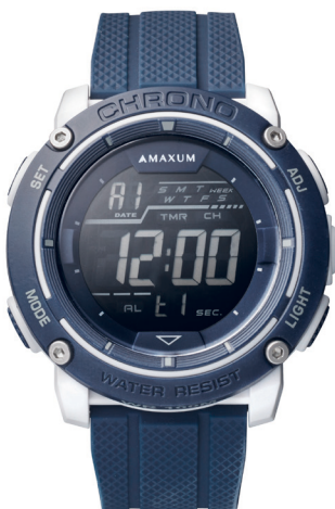
BRAVE - $99 X2224G1