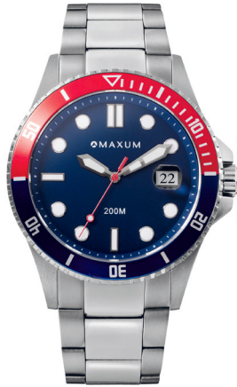
PRINCE - $249.00 MW23100G02