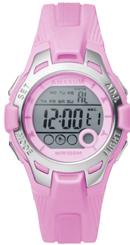
CANDY - $99 X2213L3