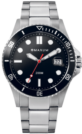
PRINCE - $249.00 MW23100G01