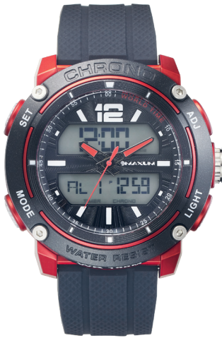
CONQUEST - $119 X2013G1