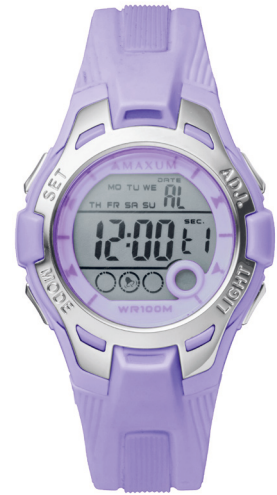
CANDY - $99 X2213L1