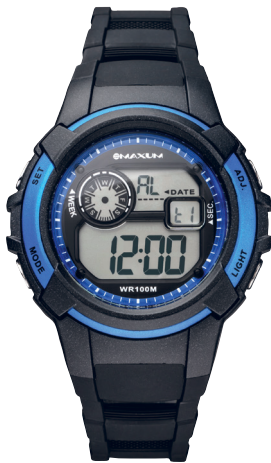
BUTTON - $99 X1676L1