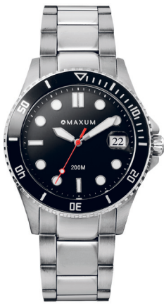
LIBERTY - $249.00 MW23200L01