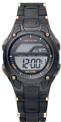
SWING - $99 X2214L1