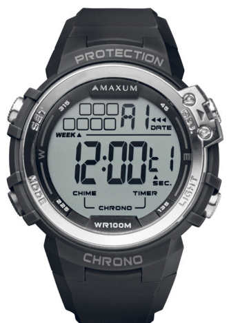
EXPLORER - $99 X2223G1