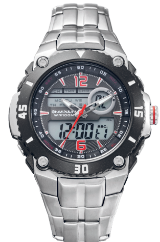
MAVERICK - $149 X2001G3