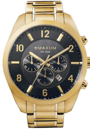
LANSDOWNE - $299.00 MW23102G02