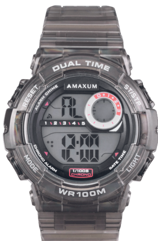
ENDURANCE - $99 X2316G3