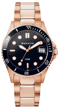
LIBERTY - $299.00 MW23200L03