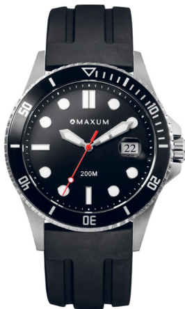
PRINCE - $199.00 MW23100G04