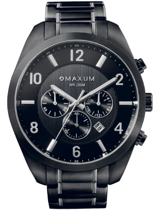
LANSDOWNE - $299.00 MW23102G03