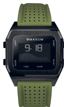
RAGLAN - $299.00 MW23104G06