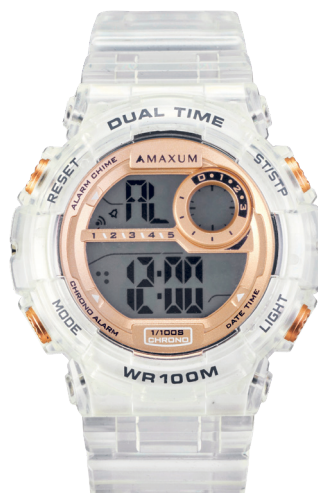
ENDURANCE - $99 X2316G2