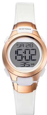
MINIMAX - $99 X1807L2