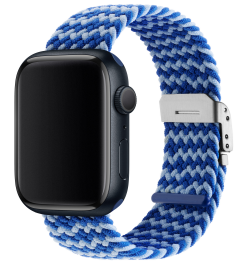
BKS42S322 100 AUD UPC: 03/01/2023 Blue&Light Blue Elastic Strap