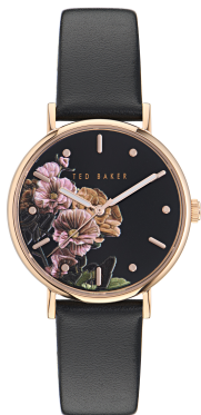
BKPPHF305 265 UPC: 08/01/2023 Rose Gold Recycled SST Case, Printed Dial, Black Eco Genuine Leather Strap