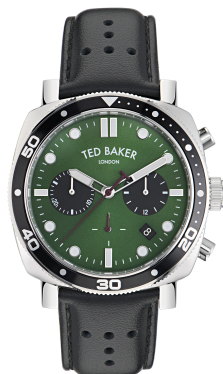
BKPCNF301 355 UPC: 08/01/2023 Silver Recycled SST Case, Green Dial, Black Eco Genuine Leather Strap