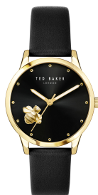
FITZROVIA BUMBLE BEE