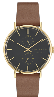
BKPPGF303 280 UPC: 08/01/2023 Yellow Gold Recycled SST Case, Black Dial, Tan Eco Genuine Leather Strap