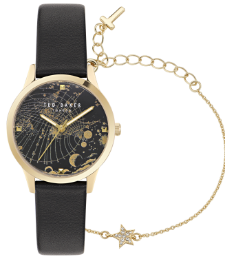
BKGFW2302 310 UPC: 08/01/2023 Sst Yellow Gold Case, Black Dial with constellation Black leather Strap&Star Bracelet