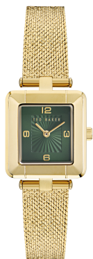
BKPMSF306 295 UPC: 08/01/2023 Yellow Gold Recycled SST Case, Green Dial, Yellow Gold Mesh Band