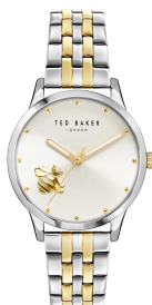
FITZROVIA BUMBLE BEE