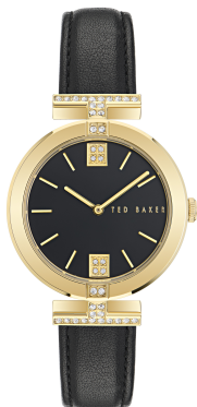
BKPDFAF301 295 UPC: 08/01/2023 Yellow Gold Recycled SST Case, Black Dial, Black Vegan Leather Strap