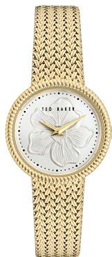
BKPEMF302 300 UPC: 08/01/2023 Yellow Gold Recycled SST Case, Silver Dial, Yellow Gold Bracelet