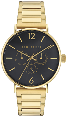
BKPPGF307 320 UPC: 08/01/2023 Yellow Gold Recycled SST Case, Black Dial, Yellow Gold Bracelet