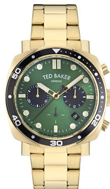
BKPCNF307 395 UPC: 08/01/2023 Yellow Gold Recycled SST Case, Green Dial, Yellow Gold Bracelet