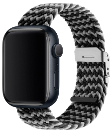
BKS42S326 100 AUD UPC: 03/01/2023 Black&Cream Elastic Strap