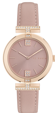
BKPDFAF302 295 UPC: 08/01/2023 Rose Gold Recycled SST Case, Pink Dial, Pink Vegan Leather Strap