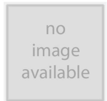
BKS42F320 195 AUD UPC: 08/01/2023 Black Bracelet with T motif