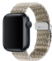
BKS38S325 100 AUD UPC: 03/01/2023 Light Brown&Cream Elastic Strap