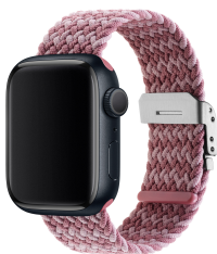
BKS38S321 100 AUD UPC: 03/01/2023 Pink&Violet Elastic Strap