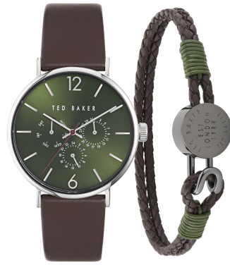
BKGFW2306 320 UPC: 08/01/2023 Sst Case, Green Dial, Brown Leather Strap&Leather bracelet