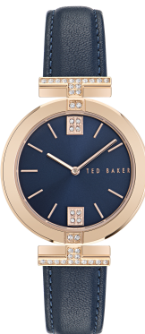
BKPDFAF304 295 UPC: 08/01/2023 Rose Gold Recycled SST Case, Blue Dial, Blue Vegan Leather Strap