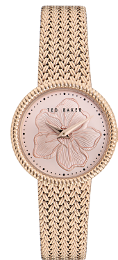
BKPEMF303 300 UPC: 08/01/2023 Rose Gold Recycled SST Case, Pink Dial, Rose Gold Bracelet