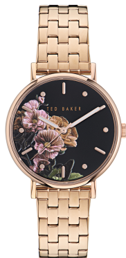
BKPPHF306 300 UPC: 08/01/2023 Rose Gold Recycled SST Case, Printed Dial, Rose Gold Bracelet