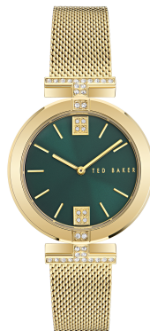
BKPDFAF305 310 UPC: 08/01/2023 Yellow Gold Recycled SST Case, Green Dial, Yellow Gold Mesh Band