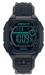
CITY TECH TWO

AOST23569 AUD 209.95 Black Resin Case Green Mask Black Resin Strap