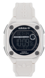
CITY TECH TWO

AOST23062 AUD 209.95 Digital, White Resin Case Black Dial White Resin Strap