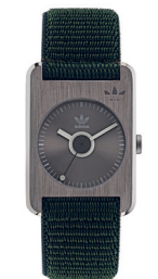
RETRO POP ONE

AOST22537 AUD 199.95 Digital, SST Gunmetal tone / Min- eral green resin case, black dial, Mineral Green nylon strap