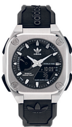
CITY TECH ONE SST

AOFH23575 AUD 349.95 SST Case Black Dial Black Resin Strap