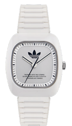
RETRO WAVE TWO

AOSY24030 AUD 229.95 White Eco-Ceramic Case White Dial White Bio-Resin Strap