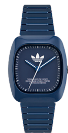
RETRO WAVE TWO

AOSY24029 AUD 229.95 Blue Eco-Ceramic Case Blue Dial Blue Bio-Resin Strap