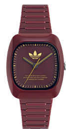
RETRO WAVE TWO

AOSY24028 AUD 229.95 Burgundy Eco-Ceramic Case Burgundy Dial Burgundy Bio-Resin Strap