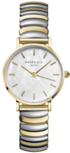
SEWDSG-SE03 Small Edit White MOP Duotone Shine Finish AUD 189.95