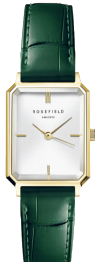
OWGLG-O86 Octagon XS White Gold Emerald Croco Leather AUD 169.95