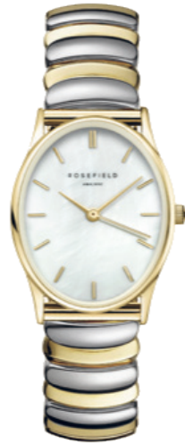
OVWDSG-OV17 Oval White MOP Duotone Shine Finish AUD 189.95