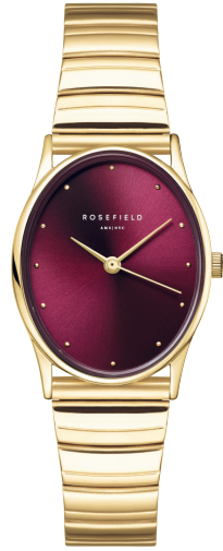
OVGSG-OV15 Oval Burgundy Sunray Gold Matte & Shine Finish AUD 189.95