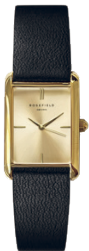
HCBLG-H07 Heirloom Champagne Gold Black Leather AUD 169.95