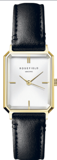
OWBLG-O84 Octagon XS White Gold Black Leather AUD 169.95