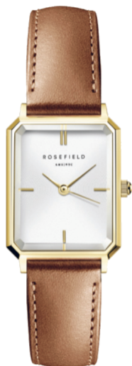
OWBLG-O85 Octagon XS White Gold Light Brown Leather AUD 169.95