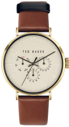
PHYLIPA GENTS TIMELESS

BKPPGS301 AUD 245 Recycled SST SST Yellow Gold Case Cream Dial Brown Eco-Leath- er Strap