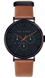
PHYLIPA GENTS TIMELESS

BKPPGF203 AUD 260 SST IP Black Case Black Dial Tan Leather Strap