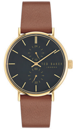
PHYLIPA GENTS TIMELESS

BKPPGF303 AUD 245 Yellow Gold Recycled SST Case, Black Dial, Tan Eco Genuine Leather Strap