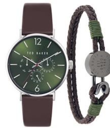
PHYLIPA GENTS TIMELESS

BKGF2306 AUD 280 Sst Case, Green Dial, Brown Leath- er Strap&Leather bracelet